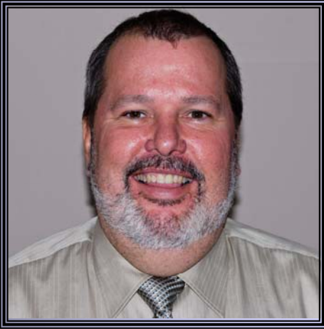
Picture Day for the church website