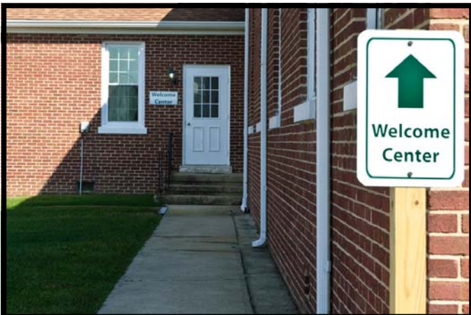
Entrance to Shiloh’s Welcome Center

If you are looking for an area church and want to join an active Christian family, we invite you to visit us. We have a wonderful Christian family who wish to reach, build, and serve King George and the surrounding community. For further information, go to the church Web site at www.kgshiloh.org or call 540-469-4646.