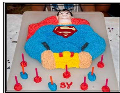
Superman cake, decorated to perfection

I emailed Wilton. No, that pan was from 1977 and they (for some odd reason) do not have either that pan or the layons, but I could